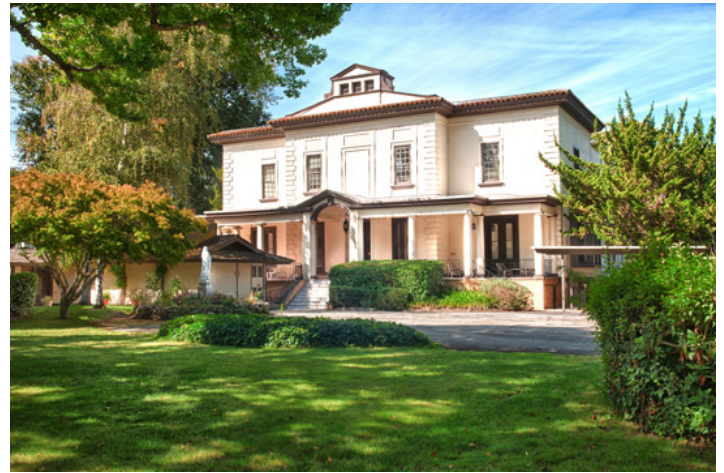
The Vallombrosa Center www.vallombrosa.org

The Weekend: Please arrive about 9:15 a.m. on Saturday. There will be three discussion periods, four fine meals, a wine and cheese reception and the showing of the 1958 movie version directed by Academy Award-winning Richard Brooks, and starring Yul Brynner, Lee J. Cobb, Claire Bloom, Maria Schell, Albert Salmi and William Shatner. The program will conclude after lunch on Sunday.