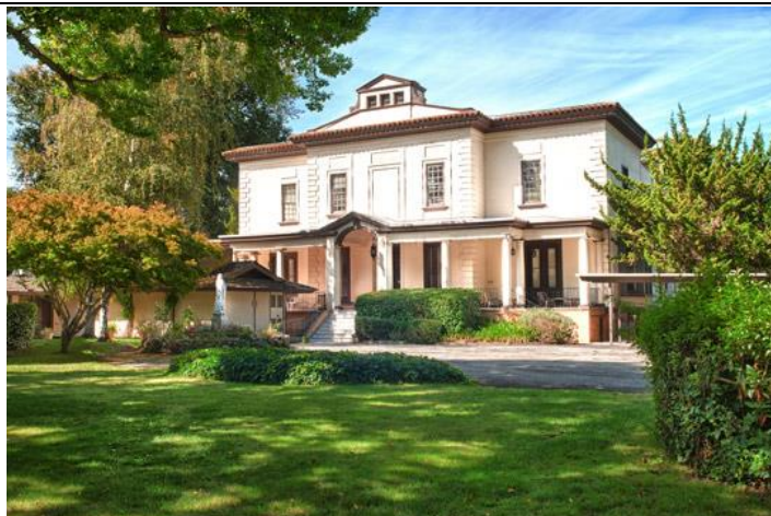
The Vallombrosa Center www.vallombrosa.org

The Weekend: Please arrive about 9:15 a.m. on Saturday. There will be three discussion periods, four fine meals, a wine and cheese reception and the showing of the 1958 movie version directed by Academy Award-winning Richard Brooks, and starring Yul Brynner, Lee J. Cobb, Claire Bloom, Maria Schell, Albert Salmi and William Shatner. The program will conclude after lunch on Sunday.