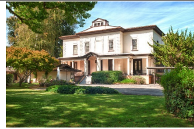
The Vallombrosa Center

The Location: The Poetry Weekend is held at the lovely Vallombrosa Conference Center located within walking distance of downtown Menlo Park. Double and single rooms are available, each with their own private bathroom. All facilities are located within comfortable walking distance. Four buffet-style meals (lunch and dinner on Saturday; breakfast and lunch on Sunday) are included.